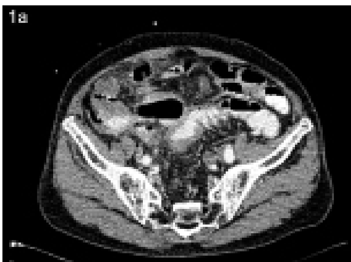
Figure 1a: Contrast enhanced computed tomography showing diffuse thickening of the rectosigmoid colon

2 Department of Surgery, 3 Department of Pathobiology and Medical Diagnostic, 4 Department of Medicine, 5 Department of Community and Family Medicine, Faculty of Medicine and Health Sciences, Universiti Malaysia Sabah, Kota Kinabalu, Sabah, Malaysia